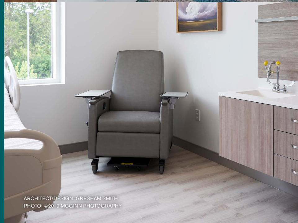
ARCHITECT/DESIGN: GRESHAM SMITH

Flooring is one aspect of the healing environment. Whether a patient, staff member, or visitor, designing with evidence-based design is a thoughtful approach to select flooring that helps contribute to positive outcomes and support the needs of all who use the space.