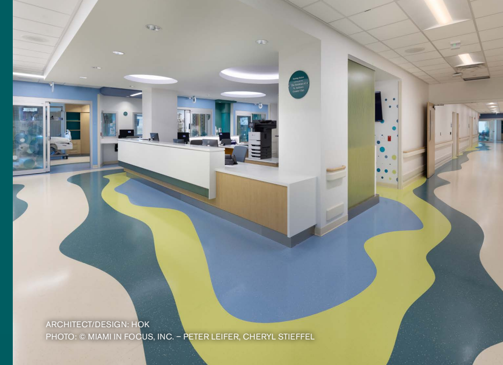
ARCHITECT/DESIGN: HOK

From clinical spaces to waiting rooms and the corridors in between, Interface flooring systems can be tailored to any environment. Let us help you to make the most of your budget, creating spaces that stand up to your most demanding needs.