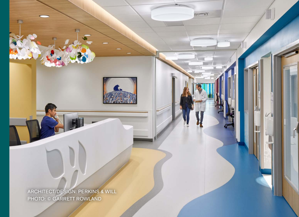
ARCHITECT/DESIGN: PERKINS & WILL