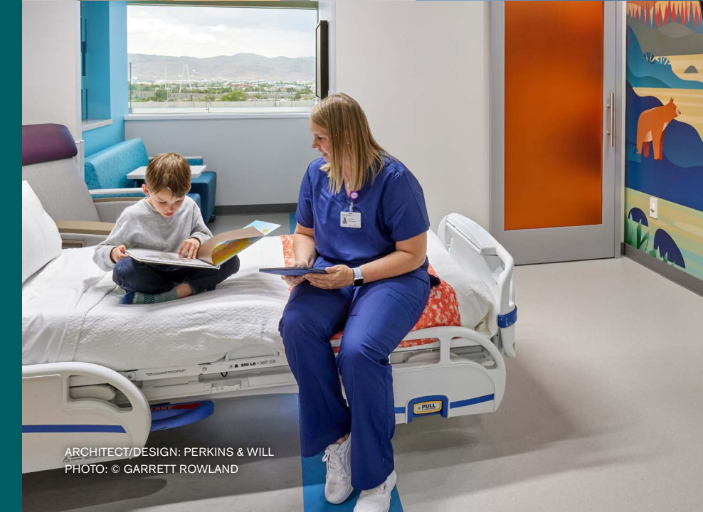
ARCHITECT/DESIGN: PERKINS & WILL