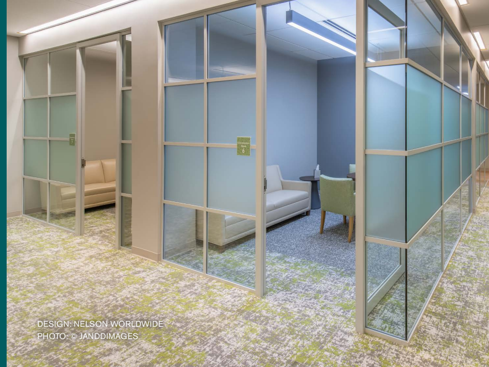
DESIGN: NELSON WORLDWIDE