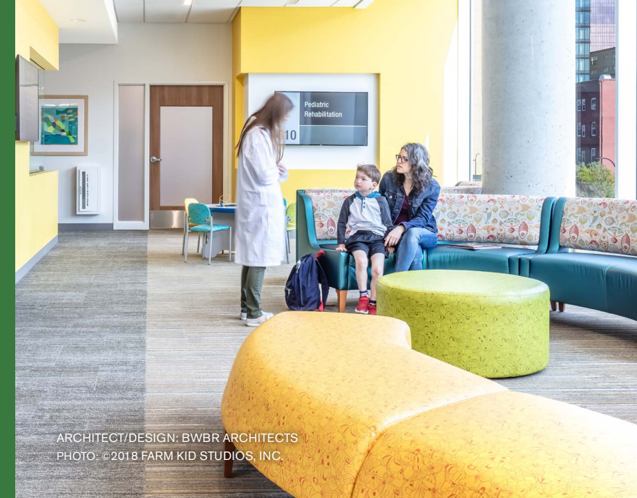
ARCHITECT/DESIGN: BWBR ARCHITECTS

As an installation partner, we can help you navigate options for removal and disposal of your existing flooring. Our ReEntry™ Program enables reclamation of used flooring and installation waste.