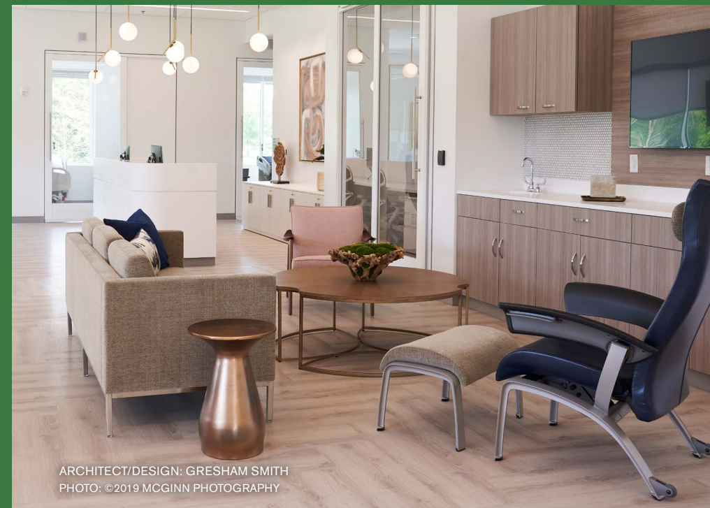
ARCHITECT/DESIGN: GRESHAM SMITH