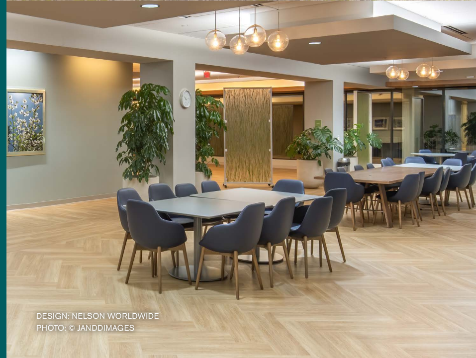
DESIGN: NELSON WORLDWIDE