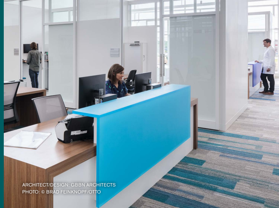
ARCHITECT/DESIGN: GBBN ARCHITECTS

A perfect fit for your unique floor plan, our portfolio of products provides a truly seamless and integrated system—from the ground up.