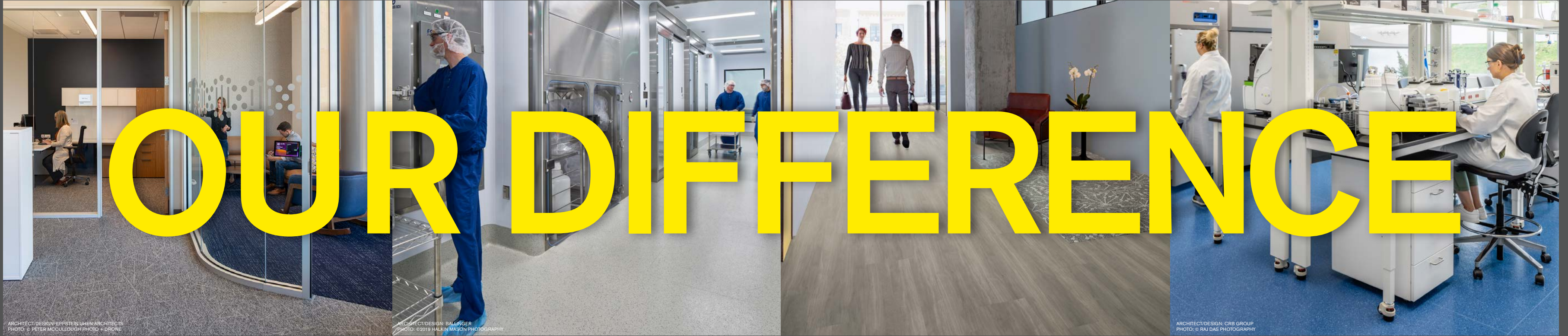
ARCHITECT/DESIGN: EPPSTEIN UHEN ARCHITECTS