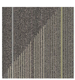
7962004 PEWTER/VERDE PRIMAVERA