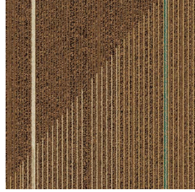
7962006 TOPAZ/AZUL VERDOSO