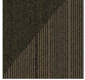
8284008 TARRAGON TONAL