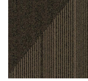
8284007 WALNUT TONAL