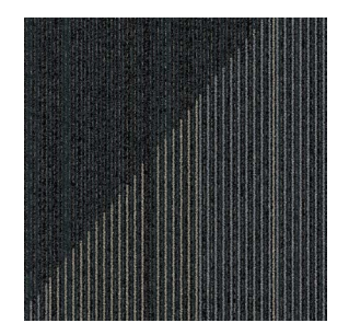
8284001 SLATE TONAL