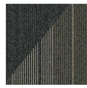
8284003 STEEL TONAL