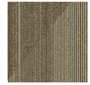
7962074 SAGE/AZUL CLARO