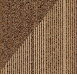
8284006 TOPAZ TONAL