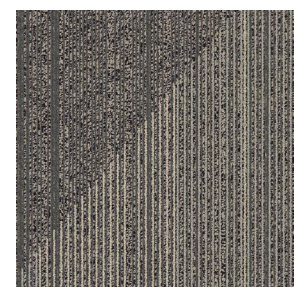
8284004 PEWTER TONAL