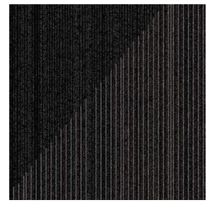
8284002 ONYX TONAL