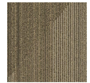
8284005 SAGE TONAL