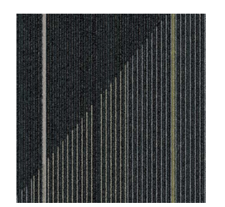
7962001 SLATE/VERDE PRIMAVERA